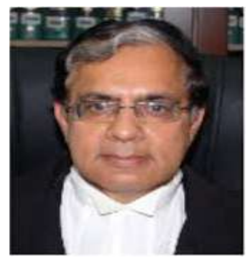
The Hon'ble Justice Arjan Kumar Sikri BCom Hons 1974 SRCC LLB 1977 LLM 1980 Double Goldmedallist Judge Supreme Court of India since 2013

New Delhi : A Supreme Court-appointed panel on Tuesday 12.07.2016 confirmed allegations against former CBI director Ranjit Sinha that he met people accused in an alleged scandal involving government allocation of coalfields from 2004 to 2009.